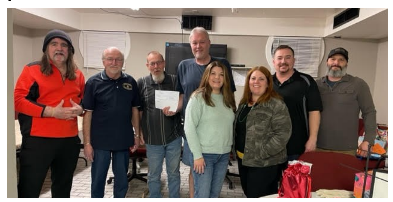
Members of Butler County Sheriff's Lodge #21

Butler County Sheriff's Lodge #21 was very happy to accept a $5000 check as a donation from the Butler Aerie #407 Fraternal Order of Eagles.