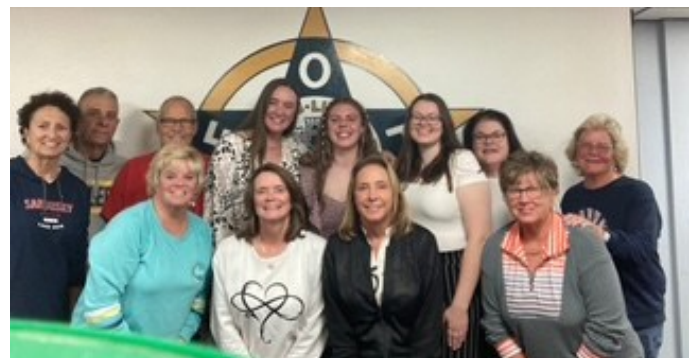
Lodge #35 members & their scholarship recipients